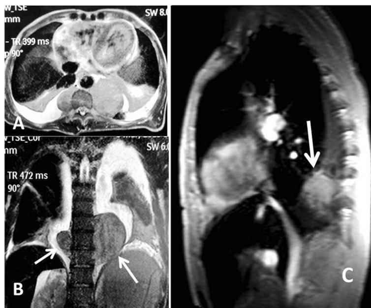
Figure 2 MRI features of the case. A: MRI scans reveals two masses in the posterior mediastinum. B: MPR on coronal plane shows a bilateral thoracic paravertebral mass. C: MPR on sagittal plane confirms the left mass in the posterior mediastinum.

of the patients are asymptomatic [7,8,10-12,18,21,22]. But some patients with mediastinum myelolipoma presented with productive cough [9], the stiff neck [13], dull back pain and a cough [14] or central chest pain [15]. The patients with pulmonary myelolipoma complain of fever [16], productive cough [17,20] or intractable lumbago [19] and the others were asymptomatic (Table 1). There was no pain or cough in our case caused by the lesion, but it was detected from the chest radiography during a routine health check.