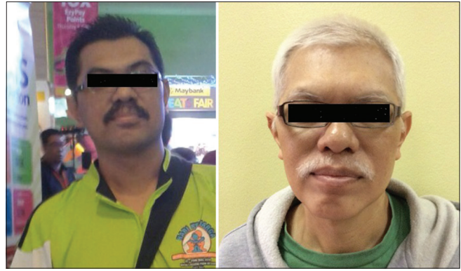
Figure 2: Photos of patient before (left) and 1 year following initiation of pazopanib (right)

Toxicities are class effects of the VEGF pathway that can occur at different times but do not affect all patients. Intensity varies depending on its potencies within its class group. It has unique nonhematologic adverse effects that differ from immunotherapy and cytotoxic chemotherapy.