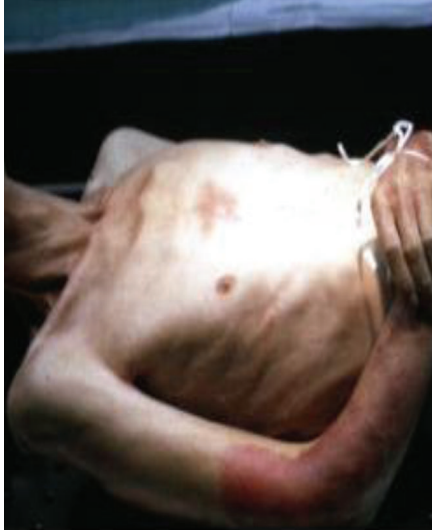
FIGURE 1: Cachectic patient (as a result of his 30-pound weight loss).