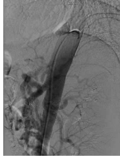
FIGURE 3: External compression of celiac artery likely by median arcuate ligament.