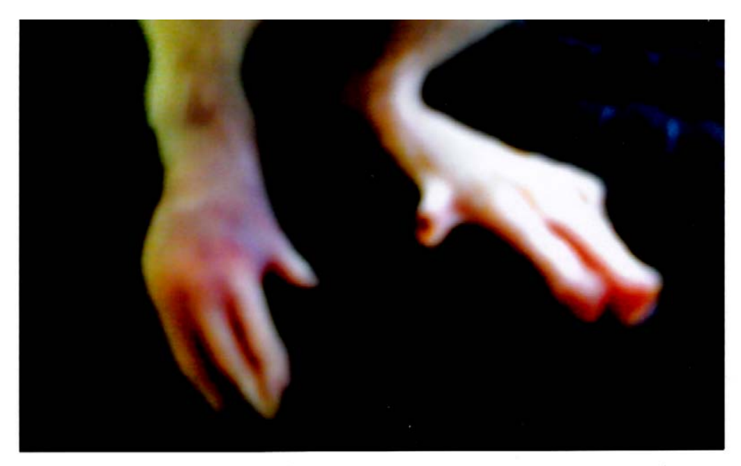
Fig. 1: After injecting Carrageenan into the hind paw