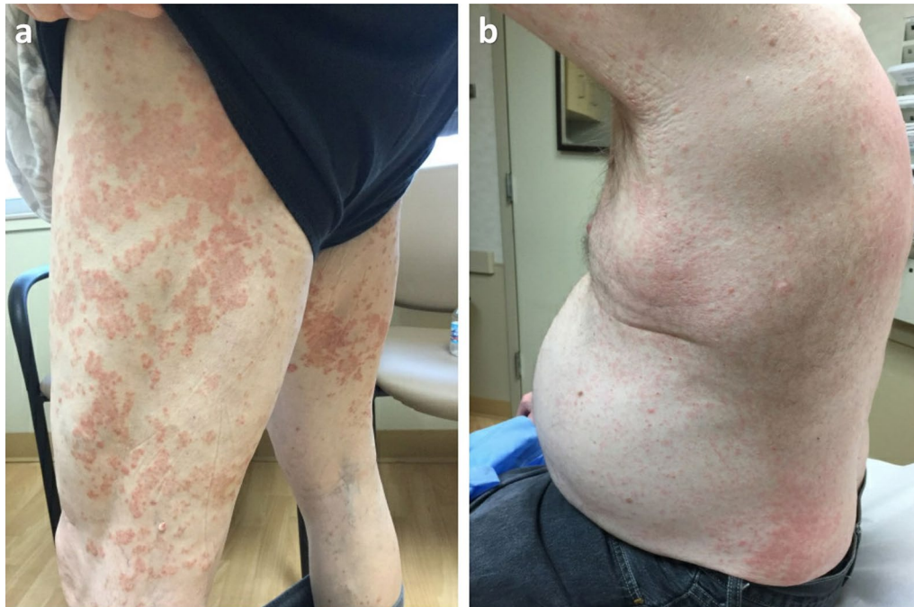
Fig. 3 Worsening of dermatitis after his initial presentation in the lower extremities (a) and torso (b)

versicolor that predated the immunotherapy and which was exacerbated by the treatment for the irAE. His underlying fungal infection was mimicking features of the dermatologic toxicity due to the irAE. Although the pityriasis versicolor was diagnosed based on the clinical features and no yeast or hyphae were seen on biopsy, the rapid resolution of his dermatitis after a short course of intensified antifungal therapy indirectly confirmed our diagnosis. We suspected that the chronic topical antifungal and steroid cream might have contributed to a false negative biopsy result. Given that his rash was already resolved, we did not perform any additional fungal testing. Furthermore, no significant skin toxicity was noted when he was rechallenged with nivolumab.