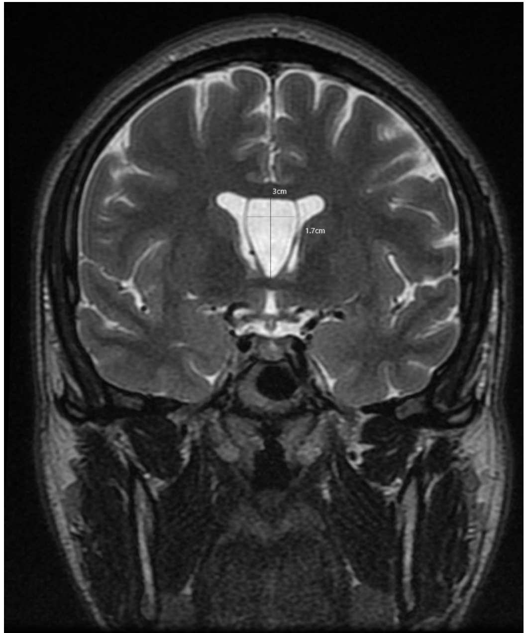
FIGURE 1: T2 weighted magnetic resonance imaging (MRI) of the head in coronal view

This is a T2 weighted magnetic resonance imaging (MRI) of the head in coronal view that is showing the full longitudinal extent of the cyst of the cavum septum pellucidum et vergae. Lateral bowing of the walls of the cavum is clearly visible which is one of the criteria required to diagnose a cyst of the cavum septum pellucidum.