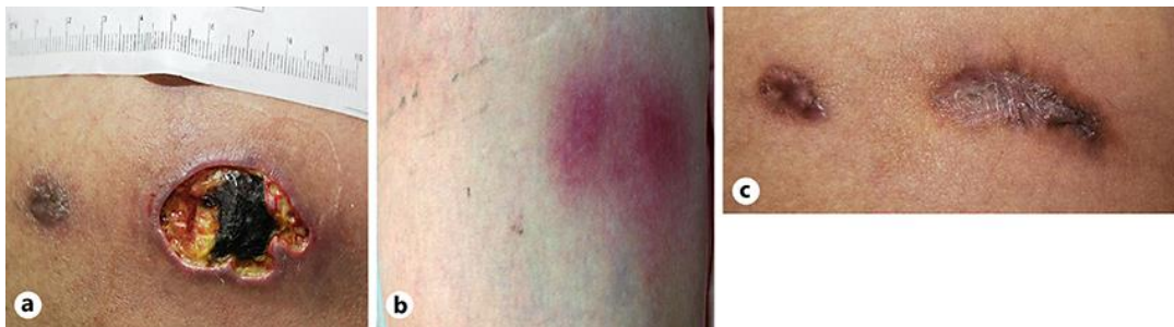
Fig. 1. Typical cutaneous lesions of primary cutaneous cryptococcosis. The patient demonstrated a 4.5-cm ulcer, resembling a pyoderma gangrenosum next to a smaller pending ulcer on the anterior aspect of the right thigh (a), a cellulitis-like lesion on the posterior aspect of the right thigh (b), and significant improvement following 4-week treatment with fluconazole (c).