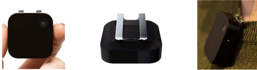
Fig. 1. Visual image of the Narrative Clip (30) .

for viewing. While the images were being uploaded, a 24-h recall interview was conducted with the participant. The 24-h recall consisted of three steps: Step (1) an initial quick list of everything the participant had eaten throughout the day, followed by Step (2) a more in-depth review of food consumption including: type of food eaten, location of where the food was consumed, amount of food, cooking methods used to prepare the food and whether the food was eaten alone or with other people. To improve accuracy, participants were shown photographs of different portion sizes to assist in quantifying the amount of food eaten (31) , Step (3) was a final review of food items and amounts recalled.