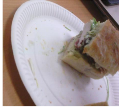
Fig. 3. Example of food images captured by the Narrative Clip.

However, two participants (10 %) stated that the camera made them more conscious of what they ate and that they tended to snack less when wearing the camera. They also noted that they were conscious that everyone could see the device if they were in a public location. While the majority ( n 13, 65 %) of participants felt that the camera did not invade their privacy, some ( n 7, 35 %) highlighted that use of the camera while using the bathroom and also in public situations was invasive. Nine participants also stated that they were conscious of the wearable camera throughout the day, especially in terms of whether the camera was positioned correctly to capture all food intake. Two participants also reported that the camera moved throughout the day or physically fell off their clothes. When viewing the images, the researcher also noted that some images were obstructed, for example due to hair, clothing and movement.