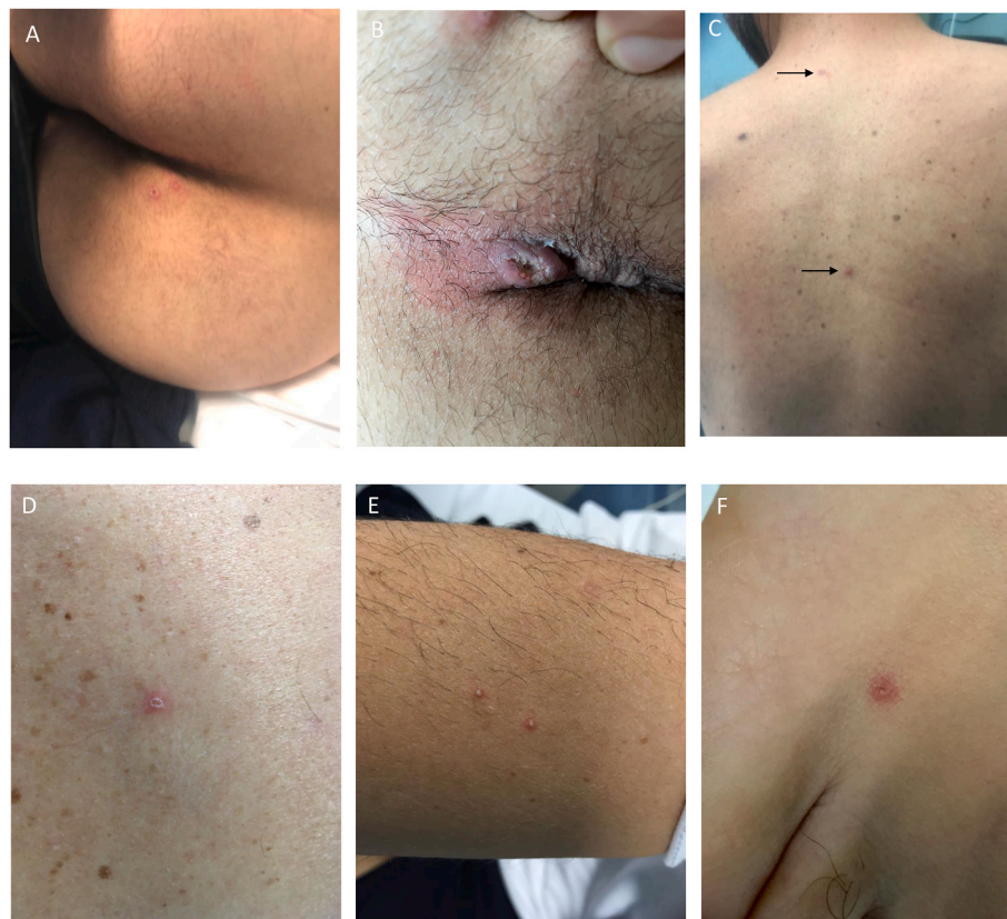
Fig. 1. A–E. Skin lesions with different appearance obtained at time of diagnosis of MPX. A, buttock. B, perianal ulcerated lesion. C, trunk. D, one of the trunk lesions at major magnification. E, two vesicula/pustular lesion of the arm. F, one foot lesion. Arrows indicate two lesions of the trunk.

Real-time Polymerase Chain Reaction (PCR) [RealStar Orthopoxvirus PCR Kit 1.0 – altona DIAGNOSTICS) targeting variola virus and non-variola Orthopoxvirus species ( Cowpox virus , Monkeypox virus , Raccoonpox virus , Camelpox virus , Vaccinia virus ] was used as Orthopoxvirus screening PCR. Monkeypox virus infection was confirmed by a specific homemade Real-Time PCR performed on Orthopoxvirus screening PCR positive samples as previously described [20]. Sampling was repeated on a daily basis to evaluate viral load variation in terms of Cycle threshold (Ct) values over time, viral shedding and virus clearance collecting also plasma, urine and seminal fluid (Fig. 2). All the positive samples were used to attempt viral isolation. In brief, a 200 \mu L aliquot of each sample was plated in duplicate in 24-wells plates containing 80%–90% confluent Vero E6 cells with 800 \mu L of Dulbecco's Modified Eagle Medium with L-glutamine (Gibco™ ThermoFisher Scientific) supplemented with 2% of heat-inactivated fetal bovine serum (Gibco™ ThermoFisher Scientific) and 1% Penicillin-Streptomycin [5000 U mL -1 ] (Pen-Strep, Gibco™ ThermoFisher Scientific). Plates was incubated at