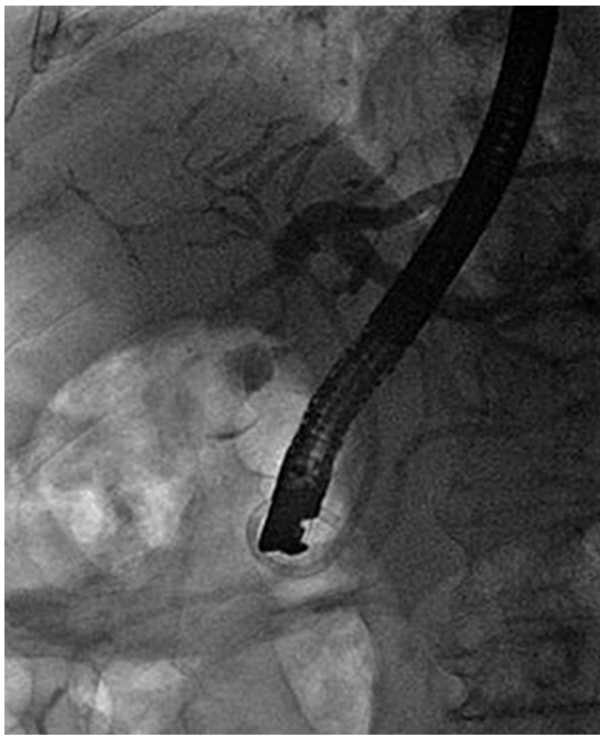
Figure 2 ERCP: internal stenting.

We performed an endoscopic retrograde cholangiopancreatography (ERCP) that clearly showed common hepatic duct compression by a large gallstone (20 mm) impacted in the cystic duct (Fig. 1), compatible with the diagnosis of Mirizzi syndrome. Successful biliary decompression was performed by internal stenting (Fig. 2) with subsequent patient referral to surgery (cholecystectomy plus closure of the fistula).