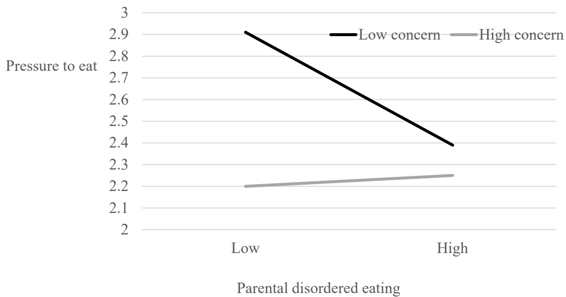
Figure 2. Interaction between parental disordered eating and concern for child's weight on pressure for child to eat.

As can be seen in Figure 2, pressure placed on their child to eat by parents with high DE was lower than pressure placed on their child to eat by parents with low DE, regardless of parental concern for child's weight. However, the pressure placed on their child to eat by parents with low DE depended on their concern for their child's weight. Parents with low DE and low concern for their child's weight placed high pressure on their child to eat. Parents with low DE and high concern for their child's weight, placed low pressure on their child to eat.