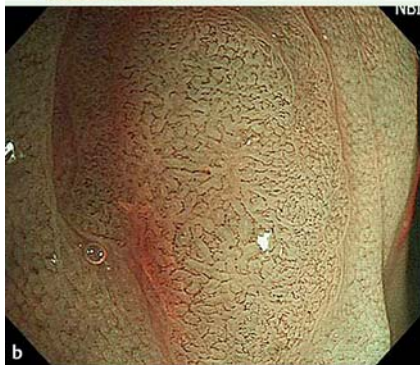
Fig. 1 Flat-type lesion (0 – IIa), 5 mm in size. A flat, light brown lesion, which was classified as NICE 2 (narrowband imaging international colorectal endoscopic [classification]) with low confidence prediction by NBI-NME (narrow-band imaging with non-magnifying endoscopy) (a) and subsequently as NICE 2 with high confidence prediction by NBI-ME (narrow-band imaging with magnifying endoscopy) (b). High magnifying endoscopy revealed the vascular pattern clearly. Histology revealed a tubular adenoma with low grade dysplasia.