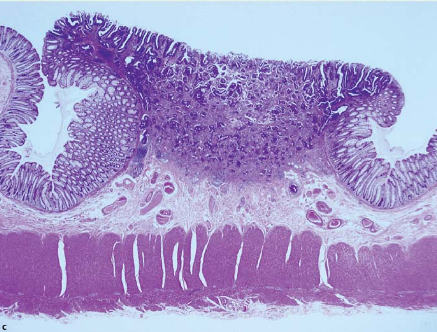
Fig. 2 Depressed-type lesion (0–Ila+Ilc), 8 mm in size. The lesion had a deeply depressed area with a non-traumatic tube whose diameter was 2.5 mm, which was classified as NICE 3 (narrow-band imaging international colorectal endoscopic [classification]) with high confidence by NBI-NME (narrow-band imaging with non-magnifying endoscopy) (a) and NBI-ME (narrow-band imaging with magnifying endoscopy) (b). High magnifying endoscopy revealed the interruption of thick vessels. The endoscopists chose to treat with surgery without endoscopic resection. Histology revealed a moderately differentiated tubular adenocarcinoma invading the deep submucosa (c).