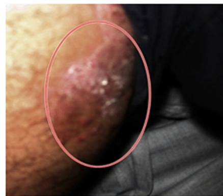
b. Tinea cruris