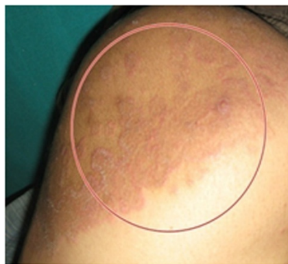
a. Tinea corporis

hyphae (pencil shaped, spiral, pyriform, septations etc.), microconidia and macroconidia (tear shaped, drop like, spherical, in bunches, abundance or rare etc.). Trichophyton rubrum (ATCC-28188), T. mentagrophyte (ATCC-18748) and Microsporum gypseum (ATCC-24102) obtained