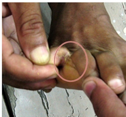
c. Tinea pedis