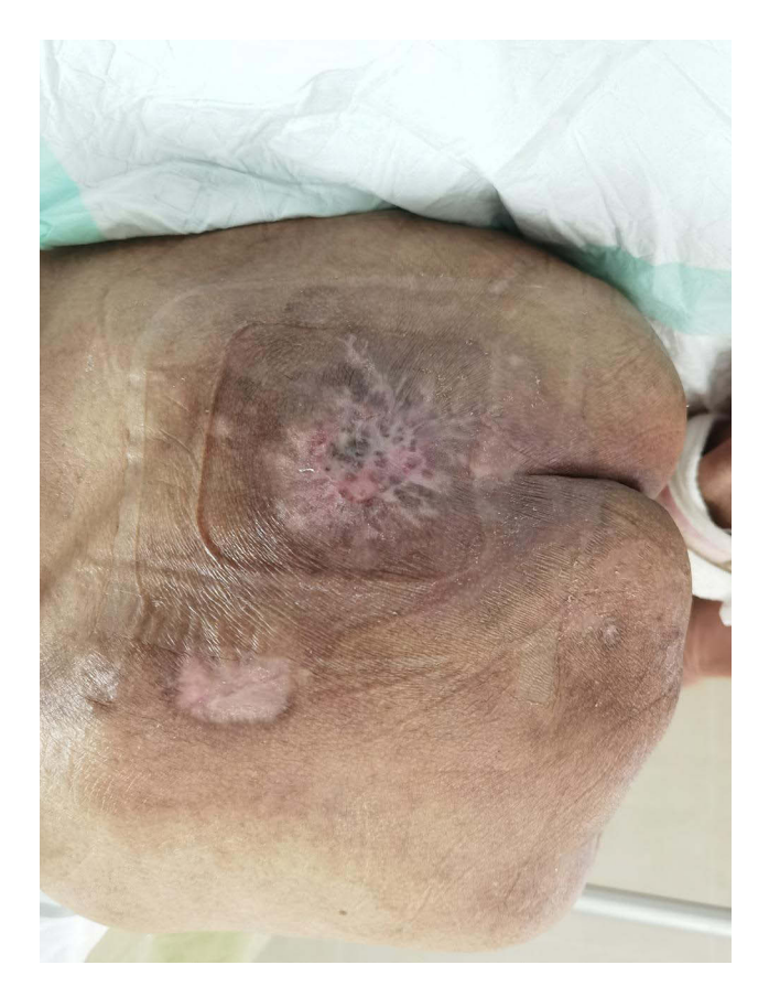
Figure 4 30 days after the operation with wound healing in Case 2.