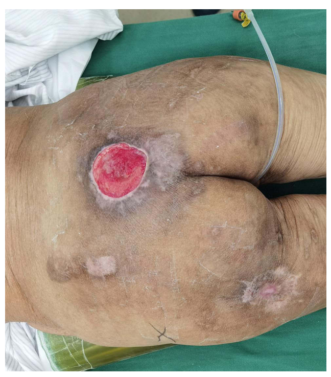
Figure 3 Preoperative condition in Case 2: Sacrococcygeal pressure ulcer (6×7 cm) with failure of the wound healing after flap grafting and conduction of the second phase micro-skin implantation.

stage 1 or 2 PU were present and were treated with closed negative pressure suction combined with continuous microoxygen infusion and healed after dressing changes. One case died during hospitalization due to an illness.