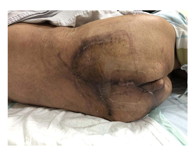
Figure 2 One month after grafting in Case I, with good flap survival.