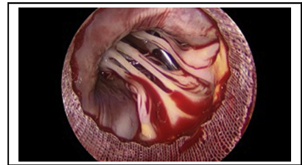
Complete deployment of the EIV (view from inside the left ventricle using the 5-mm 30-degree telescope).

https://doi.org/10.1016/j.jtc.2021.10.029