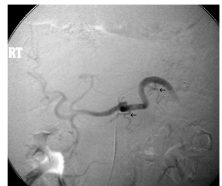
Figure 1. Celiac artery angiogram showing the proximal splenic artery and the blood supply to the body of the pancreas (black arrowheads).

60 years. 2 Surgical management is reserved for patients who have failed medical management or those with acute life threatening bleeding. Puapong et al reported on the successful splenic embolization in a child with intracranial bleeding and persistent thrombocytopenia before neurosurgical management of the intracranial hematoma. 3 From this case it would seem reasonable to embolize the spleen before serious bleeding complications develop. Additionally, Takahashi et al. reported their results on five children who had splenic embolization one day before surgical splenectomy. These children had either ITP or hereditary spherocytosis. The average blood loss was 9 mL and none of these patients had post operative complications. 4 Neuret et al. studied 863 children with newly diagnosed ITP to evaluate their risk for bleeding at admission and in the four weeks that followed. They found that 505 of these patients had a platelet count