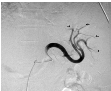
Figure 3. The intrasplenic vascular tree is significantly pruned (black arrows).

use of splenic artery embolization before successful laparoscopic splenectomy in 19 patients with massively enlarged spleens. The operative blood loss was 200 mL; one patient required reoperation for bleeding. 6 In the recent 2011 update of guidelines by The American Society of Hematology, the author noted that the timing of splenectomy should be delayed for a year if possible in children who might be failures to first line therapy. In the adult, those who fail steroids and immunoglobulin therapy and other therapies might be considered for adjunctive medical management. They noted that this is an area that needs further investigation to determine what salvage therapies are appropriate when frontline therapy has failed. They also pointed out that where strong data was lacking physicians should use their best medical judgment and consideration for the patient's wishes. 7 This patient lived alone and was fearful of having an abdominal operation at her age and was even more fearful of an intracranial bleed or stroke and loss of her independence. However, when her platelet count rose to acceptable clinical levels she was discharged from the hospital. Her platelet count continued to rise to over 150 \times 10^9/L four weeks after discharge.