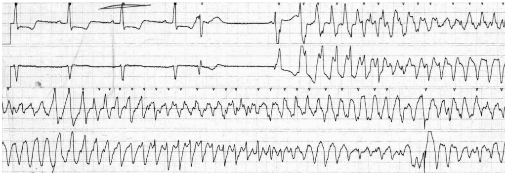
Figure 2 Rhythm strip showing polymorphic ventricular tachycardia initiated by “R-on-T” phenomenon.

between 60 and 65 bpm. The blood chemistry revealed a pH of 7.35, potassium of 4.7 mmol/L (normal range 3.2–5.0 mmol/L), and magnesium 0.91 mmol/L (normal range 0.70–1.10 mmol/L). A transthoracic echocardiogram done following cardiac arrest revealed stable cardiac structure and function with no new regional wall motion abnormalities. The patient was hospitalized for 14 days after the cardiac arrest as a result of musculoskeletal injury secondary to cardiopulmonary resuscitation and a catheter-related urinary tract infection, as well as for further investigations, which included coronary angiography (which showed native coronary artery disease but patent bypass grafts) and an electrophysiology study (which failed to induce ventricular arrhythmia with programmed stimulation and up to 4 extrastimuli, without isoprenaline). The patient was monitored on telemetry for 14 days post cardiac arrest and there was no recurrence of ventricular arrhythmia. Serial daily ECGs after ablation identified that it took 48 hours for the QTc to shorten to 450 ms and 10 days to shorten to less than 440 ms. An ECG 13 days after cardiac arrest demonstrated that the QTc was 408 ms (Figure 3A). There was no recurrent syncope or arrhythmia at 1, 3, and 6 months follow-up (including 24-hour Holter monitor). Furthermore, an ECG at 6 months follow-up showed that the QTc remained normal at 423 ms (Figure 3B).