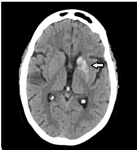
Image 1. Computed tomography head imaging, which shows hyperintensity (arrow) in left caudate nucleus concerning for potential hemorrhagic stroke.

Nonketotic hyperglycemia-induced hemichorea (or hemiballismus) is a rare condition seen with uncontrolled diabetes. It is commonly initially misdiagnosed as a seizure due to the uncontrolled choreiform movement of one extremity. 1