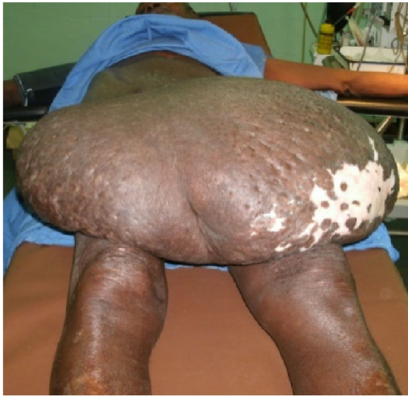
Figure 1 Scrotal mass.