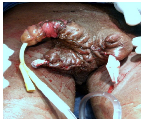
Figure 3 Postoperative appearance of the external genitalia.

In tropical countries, microfilaria is the leading cause of elephantiasis of the male external genitalia [5]. The diagnosis is mostly made based on epidemiological evidence and clinical features especially in the early phase of the disease.