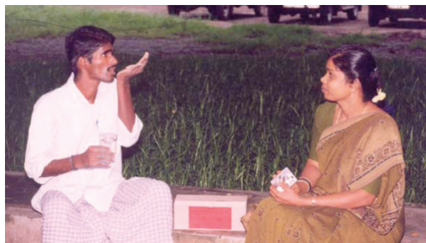
Supervised TB treatment in the field.

The legacy of contributions of the Government Hospital of Thoracic Medicine, commonly referred to as ‘Tambaram sanatorium’, a vital collaborator for