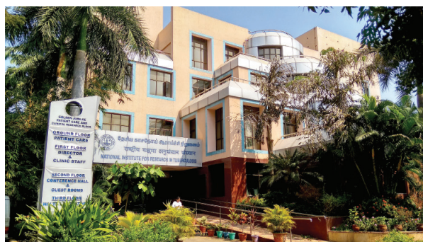
ICMR-National Institute for Research in Tuberculosis, Chennai.