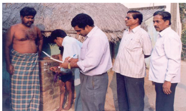
Census taking in a rural setting in Tamil Nadu.