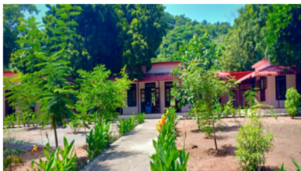
A view of the ward with plenty of vegetation, supplying fresh air and sunlight for TB patients.

Indian mathematician. Dr. Chowry Muthu, inspired and influenced by Mahatma Gandhiji's thoughts, began spending increasing amounts of time in India, treating patients with TB. Eventually, in an era when BCG was unknown, with no treatment available, he hit upon the idea of starting a sanatorium that could sequester patients and offer open surroundings with enough cross ventilation and plenty of sunlight, the only modality of treatment available at that time for these tuberculosis patients. For this purpose, he acquired 250 acres of land at the base of Pachamalai hills in Tambaram and ultimately established the TB sanatorium (currently called the Government Hospital of Thoracic Medicine) with 12 beds, inaugurated by Sir. C.P. Ramaswami Aiyer on April 9, 1928.