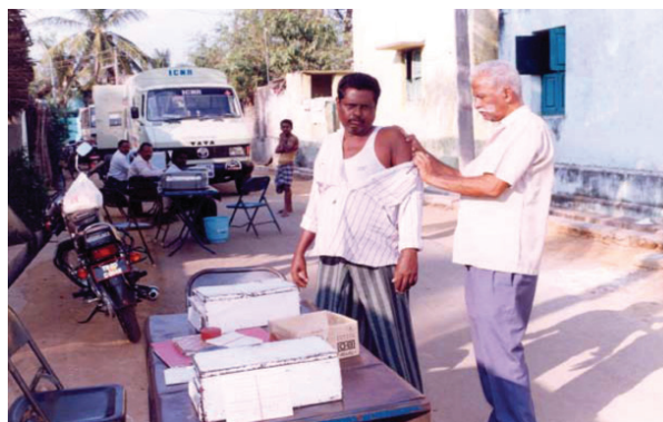
BCG scar inspection in the field.

nearly 9 decades, deserves special mention, when NIRT trials are illustrated.