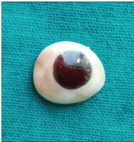
Figure 9: Finished prosthesis