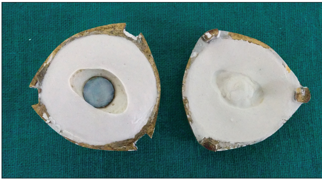
Figure 8: Prosthesis invested and dewaxed in an ocular flask