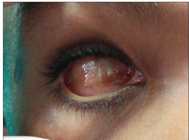
Figure 2: Detailed inspection of the enucleated socket