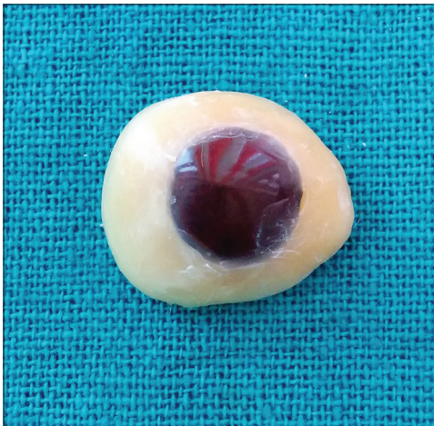
Figure 6: Finalized wax pattern