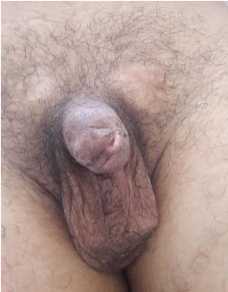
Figure 3: the result after a year of follow-up