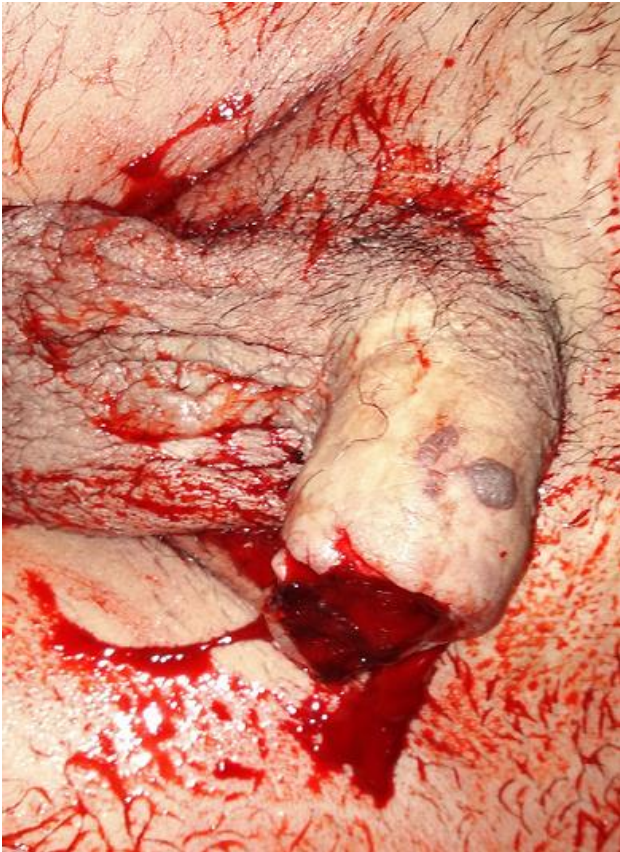
Figure 1: hemorrhagic total penile section, 6cm from the penoscrotal angle