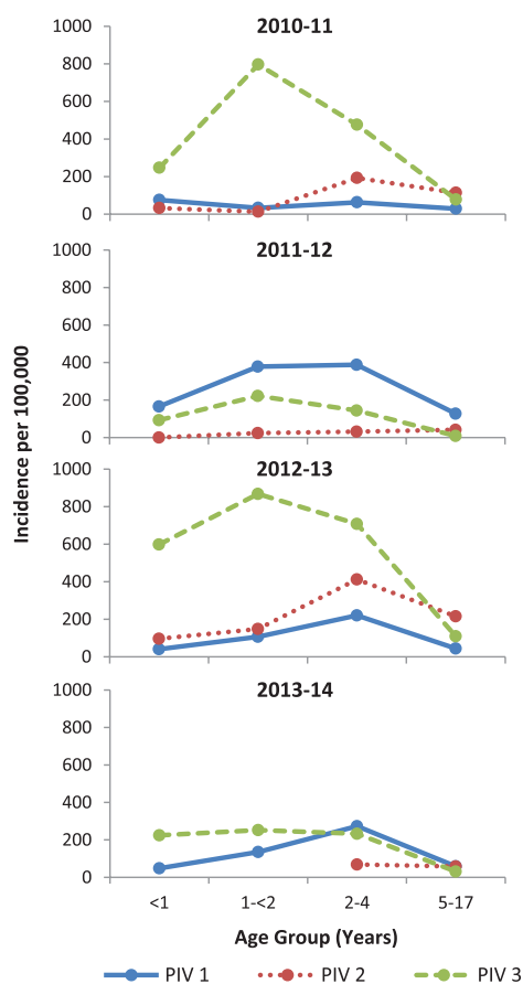
FIGURE 3. Comparison by surveillance year of age-specific cumulative incidence estimates of PIV 1–3-associated outpatient visits per 100,000 children, August 2010 through July 2014. full color online

all years (range by season 222–868 per 100,000 children). During biennial years of elevated circulation, the incidence of PIV1-associated and PIV2-associated visits was greatest in children aged 2 to 4 years (388 and 273 per 100,000 children for PIV1 in 2011–2012 and 2013–2014; 193 and 412 per 100,000 children for PIV2 in 2010–2011 and 2012–2013). In general, PIV3 affected children aged <2 years more frequently than PIV1 or PIV2 with the exception of 2011–2012 when PIV1 overwhelmingly