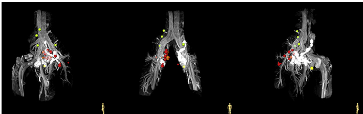
Figure 2. USPIO (ultrasmall superparamagnetic particles of iron oxide)-MRI: this frame highlight different kinds of lymph nodes suspected for metastases. Summarily, the USPIO-MRI detected 15 nodes suspected for metastases. These nodes were predominantly located at the left pre-sacral region and in the dorsal pelvis. Green: no metastasis; Light green: probably no metastasis; Yellow: uncertain; Orange: probably metastasis; Red: certain metastasis.

Up to 30% of men with PCa treated with surgery would experience BCR during follow-up. 1 The administration of ADT, which is the standard of care in the presence of metastatic PCa, 2 is debated in