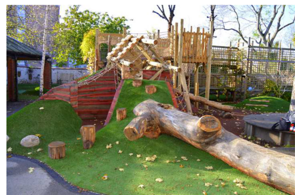
Fig. 1 A new playground construction in the Camden Active Spaces project

Trained researchers fitted accelerometers (waist mounted Actigraph GT3X) to children during the school day. Children were asked to wear the device during waking hours every day for seven consecutive days, but not during water-based activities or sleep. Devices were programmed to sample at 30 Hz. Our protocol followed methods used in the International Childrens’ Accelerometry Database study [2]. Briefly, data files were reintegrated to a 60-s epoch and none wear time was defined as 60 min of consecutive zeros, allowing for 2 min of none zero interruptions. The first partial day of wear was excluded from our analyses in order to reduce the possibility of reactivity to wearing the device (ie, increased physical activity driven by novelty effect). All children with at least 1 school day and at least 500 min of measured monitor wear time between 07:00 AM and midnight were included. Total physical activity was expressed as total counts, including sedentary minutes, divided by measured time per day