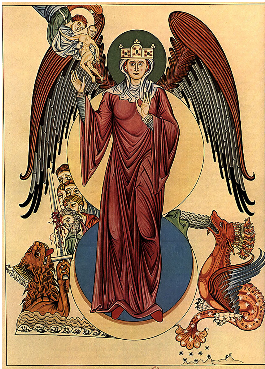
Fig 1 The woman of the Apocalypse from the Book of Revelations – redrawn from a 12th century original illustration by Herrad of Landsberg.

community transmission and that PPE was effective in protecting front-line health-care workers. 12