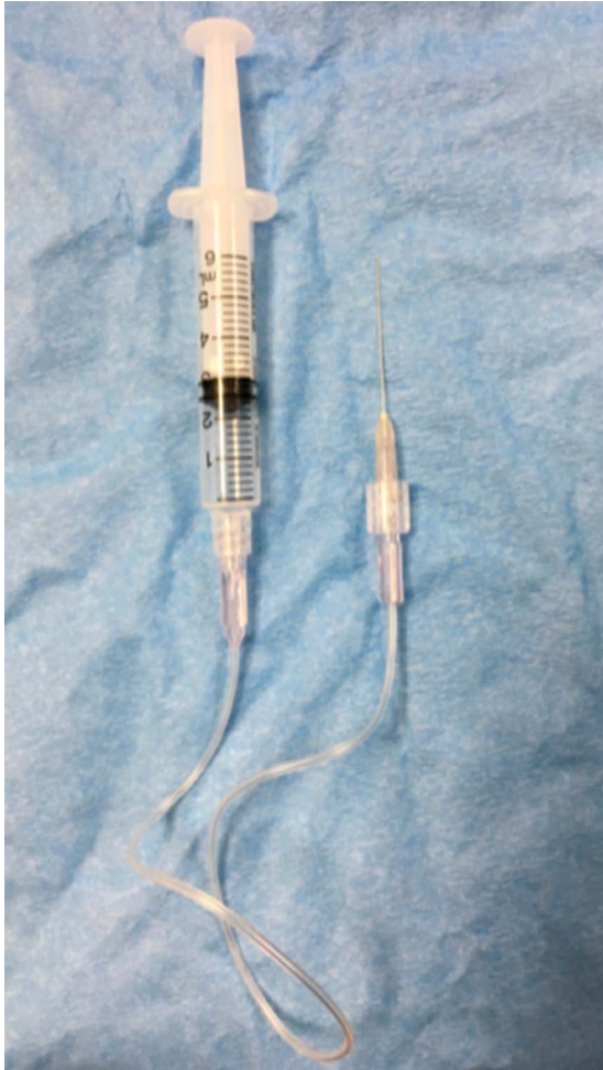
Fig. 1. Aspiration cannula, line, and syringe setup.

have merit both in terms of ensuring anatomical and functional success. Theoretically, internal retinal drainage of SRF should reduce these complications. We report a technique of internal drainage of SRF during chandelier-assisted scleral buckling surgery.