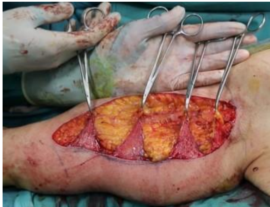
Figure 2. The dermal flaps. The shark jaw-like appearance of this step of our surgical procedure led us to name the technique the “Jaws brachioplasty”.

The perimeter of the skin to be removed is incised and dissected from the subcutaneous plane, safeguarding the adipose tissue that is not incised or affected by surgical removal. Skin is the only layer which must be excised. The respect of underlying adipose tissue and lymphatic network is a paramount target in this procedure, which must be executed carefully. This reduces complications such as lymphorrhea, seroma, and lymphoedema of the upper arm. Care is taken to leave three/four triangular dermal flaps, as per the preoperative drawing, with the apex facing the anterior edge of the arm and having the lower edge of the incision as a base. These dermal flaps are lifted by dissection from the subcutaneous plane (Figure 2).