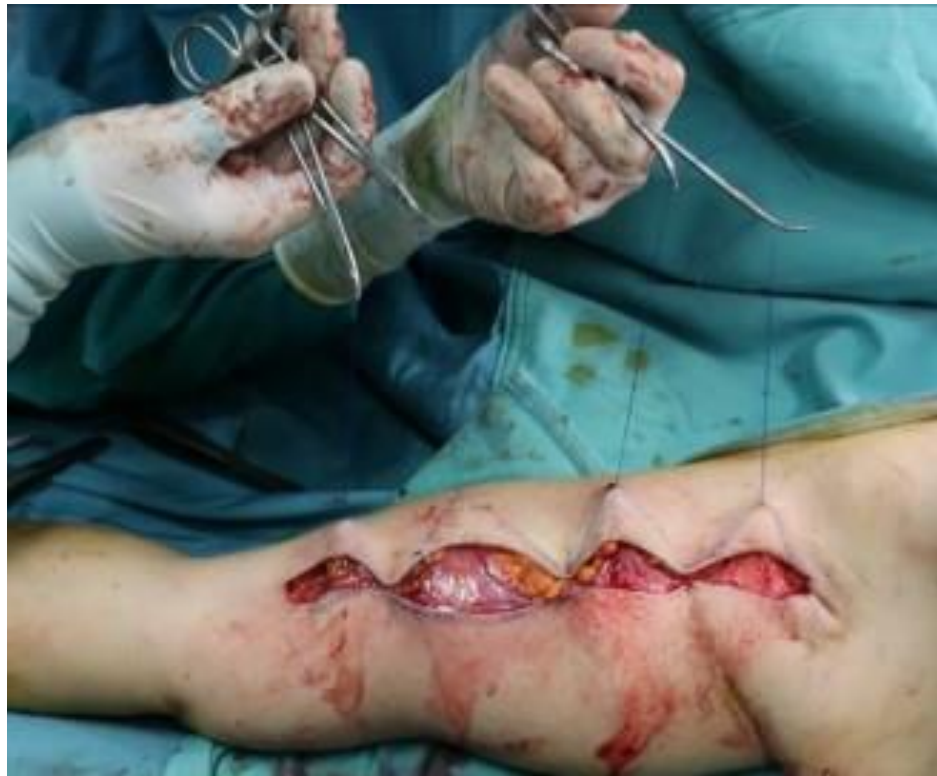
Figure 3. Fixation of dermal flaps with transfixed skin stitches.

the triangular areas obtained and fixed through transfixed skin stitches in non-absorbable material (Figure 3).