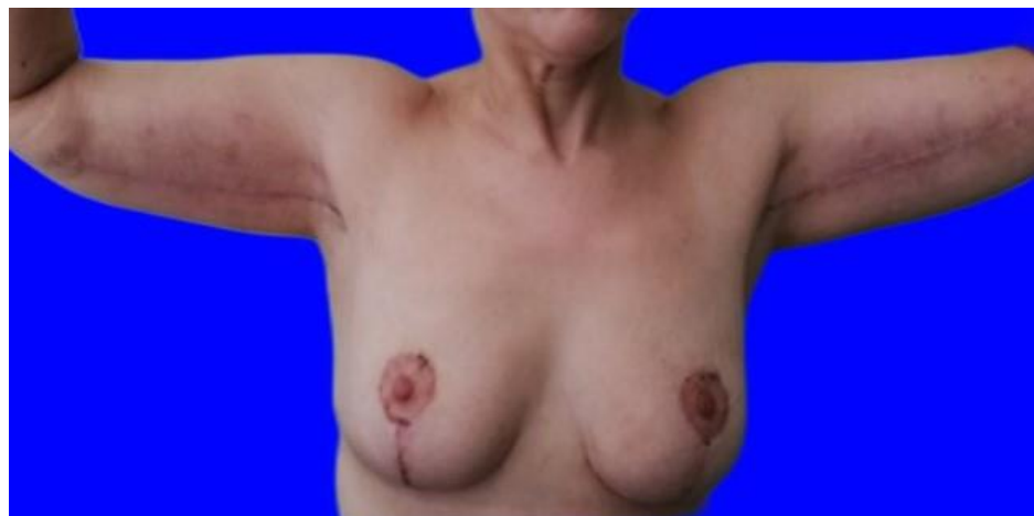
Figure 4. A patient 12 months after the intervention.

Lastly, a two-plane suture is performed: subcutaneous reversed stitches with 3/0 Vicryl ® positioned exclusively at the ends of the triangular dermal flaps, and an intradermal suture with 4/0 Monocryl ® sealed by Dermabond ® . A moderate compression dressing is applied. A photo was taken for each patient 12 months after surgery (see Figure 4).