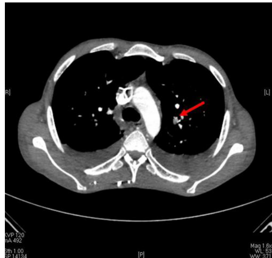
Figure 4 CT scan of the chest showing pulmonary embolism (arrow).