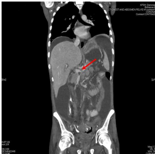
Figure 3 CT scan of the abdomen showing thrombosis in the superior mesenteric vein (arrow). Also note the ascites.