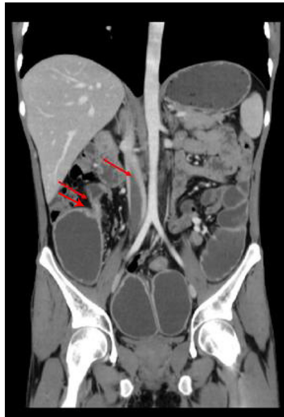
Figure 1 CT scan of the abdomen showing inferior vena cava thrombosis (single arrow). Note also partial obstruction at the distal ileum with significant dilated proximal bowel loops and bowel thickening (double arrow).