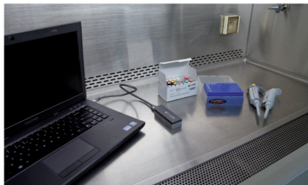
Figure 3. Analysis with MinION inside the class 2 BSC.

Another advantages of Nanopore technology is the possibility to create extremely small sequencers. MinION measures 9.5 \times 3.2 \times 1.6 cm, draws its power from a laptop or tablet via a Universal Serial Bus connection, with a total mass of less than 100 grams so it is smaller than a smartphone. For working it have to be plug into a PC or laptop by the USB cable. That made it also possible to take it into International Space Station [35, 36] or in the Antarctic Dry Valleys [37] so it is also possible to implement it also in the BSL-3 and 4 laboratory environment and prepare all the sequencing steps inside the BSC. It would be also possible to use MinION in the field laboratory e.g. in Africa, that is in areas directly exposed to possible outbreak of e.g. Ebola virus [38, 39]. Moreover, the overall price of the sequencing chamber is relatively low, thus can be considered disposable in BSL3 or BSL4 applications. The only thing that would get contaminated and that would have to be get out from the BSC is the