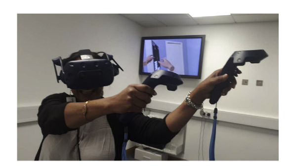
Figure 1. VR user in action in the VR suite.

An online survey (SurveyMonkey) was disseminated via email to all Stage 1 undergraduate students (n = 105) when they were midway through their second academic trimester. By this point, students had completed a two-week clinical placement block. The survey was used to evaluate students' perceptions of the VR radiography simulation software as an educational tool. Closed-ended questions based on a 5-point Likert scale (strongly agree, agree, neutral, disagree and strongly disagree) were included to encourage responses.<sup>19</sup> A limited number of open-ended questions were included to allow further expression of opinion. The survey explored the students' opinions of Virtual Medical Coaching VR as a