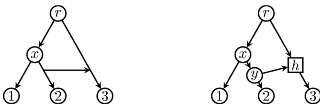
Figure 3 Representing a lateral gene transfer event as a hybrid node. Representation of a lateral gene transfer event (left) as a hybrid node in a phylogenetic network (right).