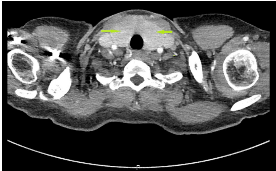
FIGURE 1: CT imaging showing markedly enlarged heterogeneous thyroid gland with prominent cervical lymphadenopathy (arrows)

On examination, she was hypertensive, tachycardic, and later developed fever as high as 101.6 degrees Fahrenheit. The neck was supple with a prominent thyroid gland, more on the left, associated with tenderness on palpation. Thyroid function tests revealed elevated free T4 of 5.5 [0.61-1.12 ng/dl] and T3 of 7.6 [0.87-1.78 ng/ml] with thyroid-stimulating hormone (TSH) level of 0.01 [0.34-5.6 uIU/mL]. The electrocardiogram disclosed sinus tachycardia with ventricular rate of 135 and non-specific T-wave abnormality with no ischemic changes. CT pulmonary angiogram ruled out central pulmonary embolic disease, but incidentally noted a markedly enlarged heterogeneous thyroid gland with prominent cervical lymphadenopathy (Figure 1). Thyroid ultrasound revealed enlarged heterogeneous thyroid gland with increased vascularity (Figures 2, 3). Thyroid-stimulating immunoglobulin turned out to be abnormal at 324% of the reference control. The patient was started on methimazole 30 mg daily along with propranolol 40 mg four times a day, with improvement of her clinical symptomatology. At the time, repeat HIV parameters revealed improvement in virologic control while on bicitegravir/emtricitabine/tenofovir alafenamide and a CD4 count of 330.