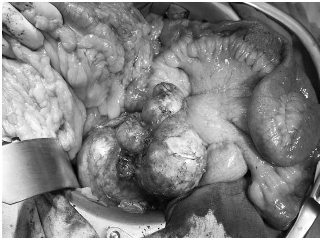
Fig. 2. The transverse colon (left), the jejunum (right), and the multivesicular cystic lesion originated from the uncinate process of pancreas (middle). Note that the photo has been taken intraoperatively

During the exploration, a cystic mass with different sizes of daughter cysts was found in the uncinate process of pancreas infiltrating the retroperitoneum ( Fig. 2 ). The cystic lesion was enucleated and the uncinate process of pancreas was resected ( Fig. 3 ). After an eventless