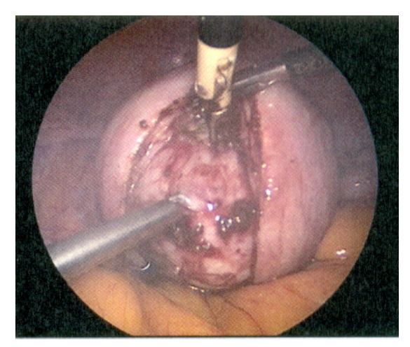
Figure 3: The myometrium overlying the myoma is opened and the myoma is visible. A myoma screw was inserted into the myoma.