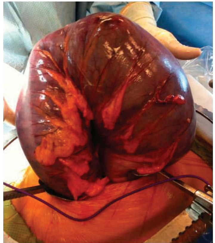
Figure 2. Intraoperative findings revealing sigmoid volvulus.

Sigmoid volvulus has been classically divided into 2 types, by clinical course, as described by Hinshaw and Carter. 5 Acute fulminating volvulus, caused by a complete obstruction, has a clinical presentation of sudden onset periumbilical pain with emesis and constipation. Patients frequently have peritoneal signs on examination. 5 Gangrene and perforation are commonly early complications with this type of volvulus. Conversely, with subacute progressive volvulus, patients have only partial obstruction and therefore have a more insidious onset. The subacute form is frequently seen in older patients, with a more subtle clinical picture, described as poorly characterized abdominal cramping, often worse on the left side