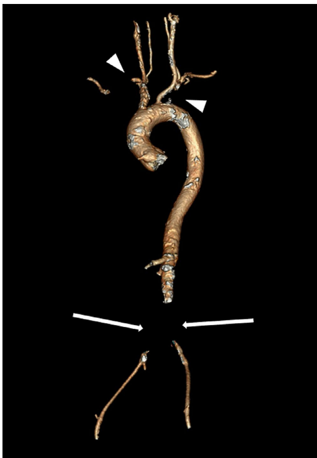
FIGURE 1 Computed tomography angiography showing a total occlusion of the infrarenal aorta and both common iliac arteries (arrows), and a total occlusion of both subclavian arteries (arrowheads)

carotid artery. However, arterial access could be obtained proximally at the left carotid artery. The CCTA showed