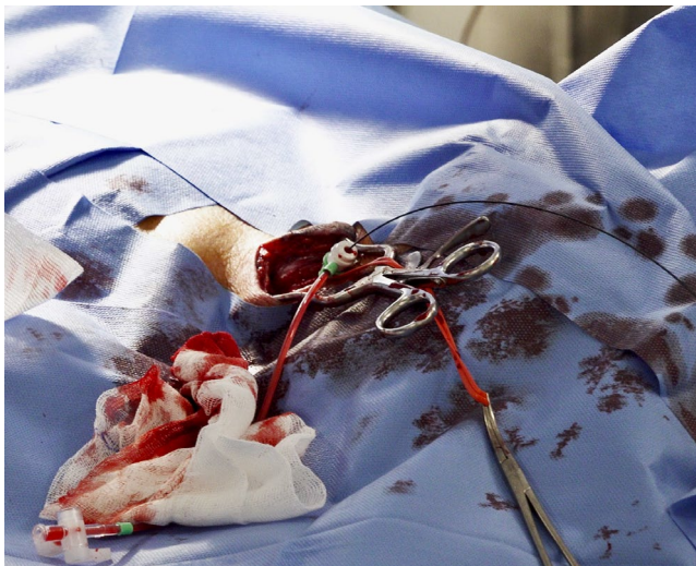
FIGURE 3 Perioperative view, showing the left common carotid artery with a 6 French sheath fixated to the sternocleidomastoid muscle

The transcarotid approach has been described as a viable alternative for vascular access in several other procedures,