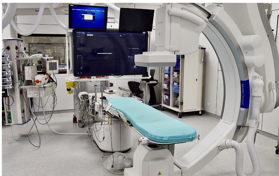
FIGURE 2 Configuration of the catheterization laboratory, which allowed for carotid access site preparation and percutaneous coronary intervention

The length of the combined procedure was 111 minutes, with a total fluoroscopy time of 14 minutes. The total dose area product (DAP) was 25.311 Gy.cm 2 , with a total