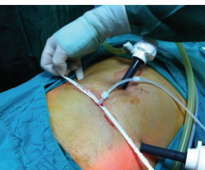
FIGURE 3: Peel-away sheet is taken out.