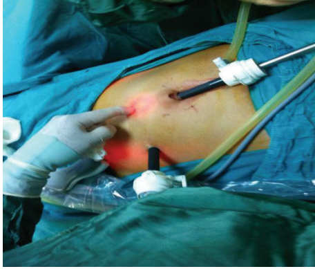
FIGURE 1: Entering sites of two ports.

complications. In fact, the incidence of omental wrapping, catheter displacement, and intraabdominal complications, specifically bowel and bladder perforation, is higher with these two methods [5, 9]. In particular in patients suspected of having intra-abdominal adhesions, the application of laparoscopic surgical techniques has significantly changed our surgical approach to dialysis catheter placement, but the debate on open or laparoscopic placement of PD catheters is still ongoing [5, 8, 10, 11]. Malfunction of the peritoneal catheter is a frequent complication in peritoneal dialysis and results in catheter loss. Therefore, it is vital that the dialysis catheter tip is sited and secured accurately in the pelvis if long-term catheter function is to be achieved. This has led to improvements in laparoscopic techniques, including the preperitoneal tunneling, pelvic fixation, omentopexy, or other minimally invasive one port insertions, which aims to minimize omental wrapping and catheter dislocation [11–20].