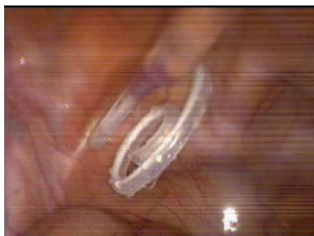
FIGURE 4: Tenckhoff catheter is introduced in the minor pelvis.