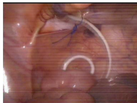
FIGURE 5: Fixation suture is performed.