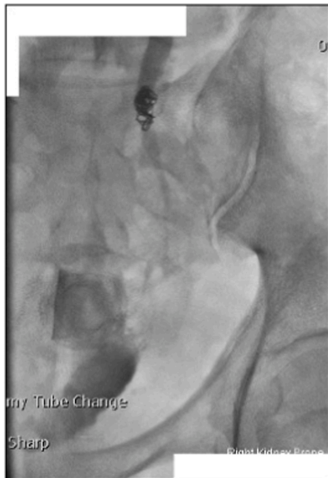
Fig. 2. Repeat nephrostogram demonstrating contrast bypassing coil/glue pack and into pelvic collection.

This minimally invasive technique is a permanent option in patients with ureteral-ileal anastomotic leaks, unsuitable for major surgical intervention and who have failed standard draining methods. It is a technique that has been described previously to treat cases of intractable haematuria, malignant ureteral fistulas and vesicoureteral reflux, with variable success (55%, 70% to 80% and nearly 100%). 2-4 Other described ureteral embolisation techniques include the use of angiography balloons, detachable balloons, nylon plugs and gelatin sponges. The pathogenesis of ureteral occlusion is ureteral stricture from urothelial irritation and induction of hyperplastic tissue. Complications arising from ureteric embolisation include migration of coils, softening