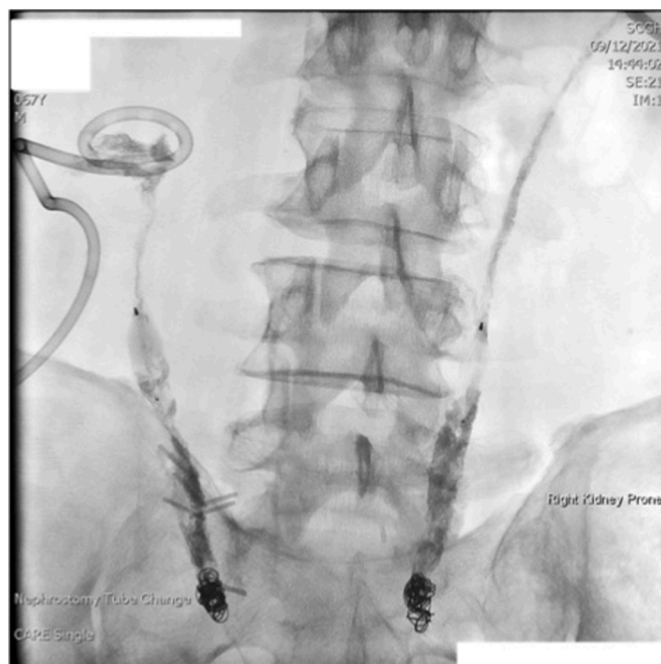
Fig. 3. Final nephrostogram demonstrating no contrast leakage beyond embolisation location.