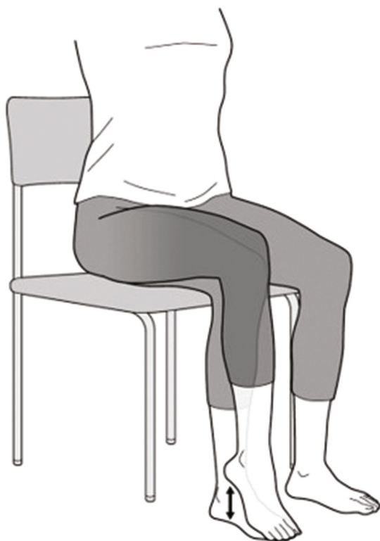
FIGURE 1: Jiggling exercise method. The patient continuously shakes his or her foot and leg in small steps whilst sitting on a chair for at least 30 minutes a day.

such as nonsteroidal anti-inflammatory drugs (NSAIDs) to the patients especially during the initial application of the exercise.