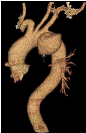
Figure 2. CT angiography of aorta. White arrow pointing to pseudoaneurysm of aorta distal to subclavian origin.