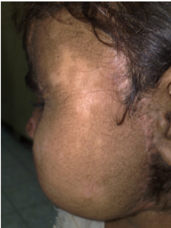
Figure 6 Spots have faded away.

cess. The mother having witnessed the life and death of her previously affected offspring, unsurprisingly, accepted with enthusiasm donating her skin. Attempts to resurface their faces have been tried using autologous skin that ended up developing malignant lesions as it still carries the same genetic defect. To the best of the author's knowledge, this is the first attempt of allotransplantation for patients with Xeroderma pigmentosa.