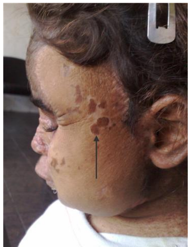
Figure 4 Spots marked by an arrow denoted early rejection.