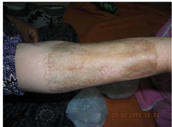
Figure 12 Late Postoperative follows up of the donor site in the mother's forearm; covered by a split thickness graft.

There were two issues as regards timing in this procedure. First, is whether to do the transplantation before or after development of malignant lesion? Second, is whether to do the skin expansion before or after transplantation i.e. in the arm of the mother or in the face of the patient? Prophylactic excision was chosen in this case to avoid the use of immunosuppressants in the face of a coexisting invasive malignancy. It might seem logical and tempting to expand the skin in the arm of the mother to allow harvesting ample tissue with the expander in a rather convenient anatomical site. However, tissue expansion was deferred to a post-transplant stage. The reason was that transferring ample skin would have simply meant excision of ample facial skin as well from the patient. Should removal of the graft prove to be necessary