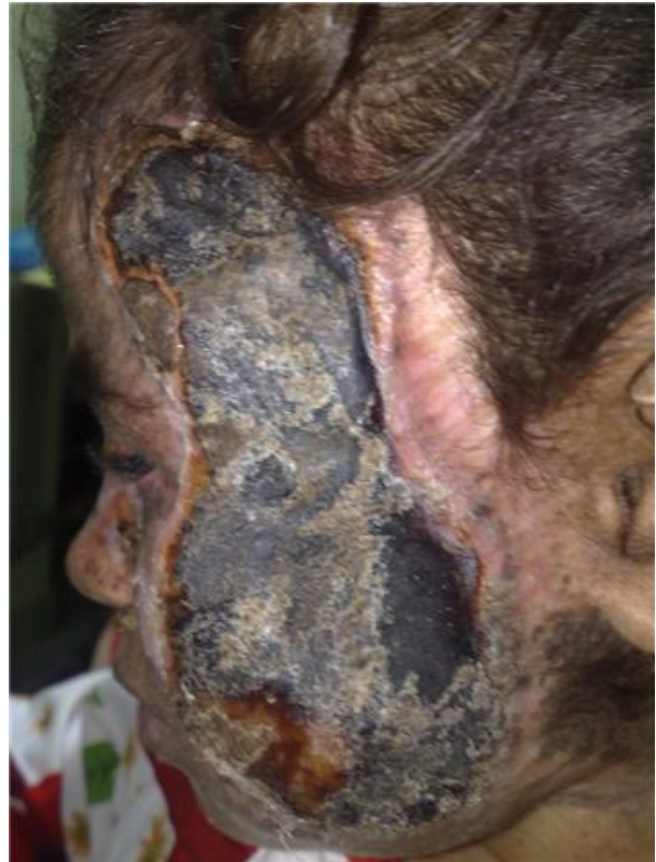
Figure 7 Irreversible graft rejection.