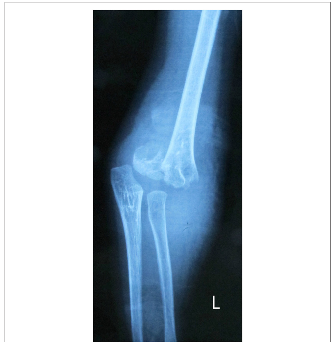
FIGURE 1 | Gartland type III supracondylar fracture of a 4-year-old girl.

Dual-energy X-ray absorptiometry (DXA) is the gold standard for measuring bone mineral density (BMD), making the diagnosis of osteoporosis and monitoring BMD (13). GE Lunar