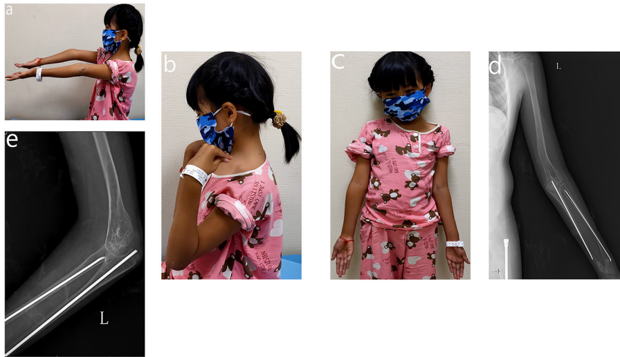
FIGURE 4 | Appearance and function of 18-month after plate removal. (a) Extension of the elbow joint. (b) Flexion of the elbow joint. (c) Appearance of upper extremity. (d) AP view of the left upper extremity. (e) Lateral view of the left elbow joint.

density, increased cortical diameter and increased bone volume (25). Bisphosphonate therapy has been given to children with OI for over three decades, and various studies have concluded that bisphosphonates could increase BMD in children with OI and decrease their fracture rate in the range of 30–60% (26–28). Recent studies showed that both oral and intravenous bisphosphonates therapy seemed to be associated with a lower rate of long-bone fractures in children with OI (27, 28). Trejo and Rauch suggested intravenous administration might be a better choice because it could improve mobility and positively affect the spine of growing children with OI (27). Therefore, both oral and intravenous bisphosphonates were administered to this patient.