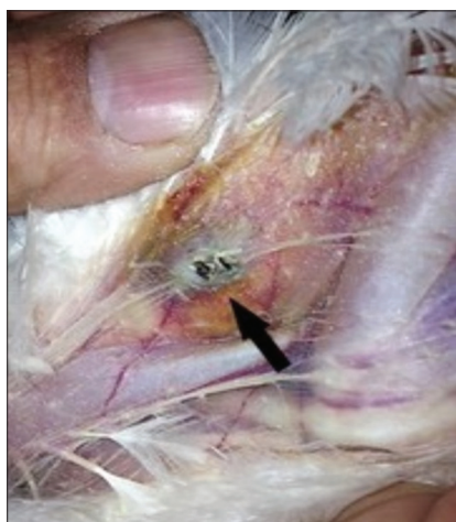
Figure-1: Pox vaccine "take" at 6-8 days post-vaccination in the avian encephalomyelitis + fowlpox + pigeon pox field vaccinated chickens.

*Slight increase in mortality at 3WPV was due to the post-vaccination reaction associated with the simultaneous administration of ILT modified live virus vaccine to the AE+FP+PP vaccinated birds by eye drop method.