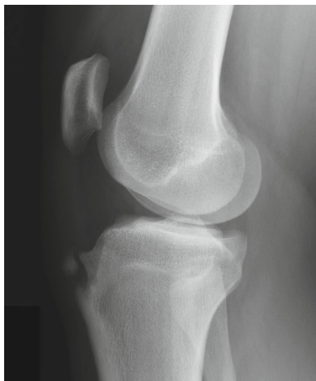
FIGURE 1: Preoperative, 17-year-old male with bony fragmentation and bump due to Osgood-Schlatter disease on the right knee.