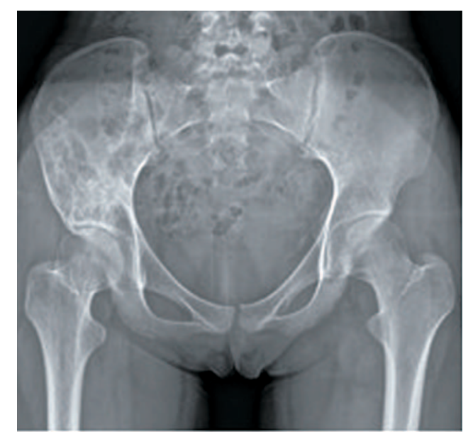
Fig. 4. Follow-up radiograph at 3 years and 6 months postsurgery. The radiograph shows good remodeling and no involvement of the hip joint.

Curettage and bone grafting are known as palliative treatments for aneurysmal bone cysts<sup>2)</sup>. However, the recurrence rate after either curettage or a combination of curettage and bond grafting is 13%<sup>1)</sup>. Either selective artery embolic treatment or a combination of chemical sclerotherapy and electrocautery before surgery has been suggested to reduce recurrence<sup>2-4)</sup>. Preoperative selective artery embolic treatment has been performed either as primary treatment or for difficult-to-access lesions; it has also been used to reduce operative bleeding<sup>3,4)</sup>. However, artery embolic treatment is not easy to perform, since there is often more than one feeding artery in aneurysmal bone cysts. In addition, if a normal artery is invaded, ischemic necrosis may occur in normal tissues as well as nerves<sup>3)</sup>. When it comes to pelvic aneurysmal bone cysts, embolic treatment should not be performed in lateral circumflex femoral arteries and pudendal arteries, which are distributed over sciatic, femoral and lateral femoral cutaneous nerves<sup>6</sup>.