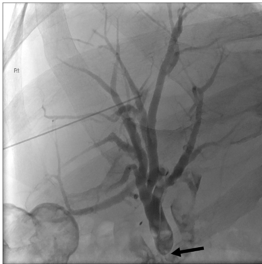
Fig. 1. Percutaneous transhepatic cholangiography was performed and an hepatico-jejunal anastomotic stricture was demonstrated (depicted by black arrow).

He proceeded to an uncomplicated Whipple's procedure. Histopathology of the specimen showed R0 resection of an invasive adenocarcinoma with no vessel, neural or nodal invasion. He received adjuvant chemotherapy and did not develop any related complications.