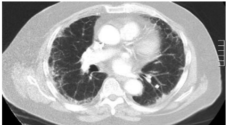
FIGURE 2. Representative image from re-staging CT January 2009; bilateral peripheral subpleural reticular changes and interlobular septal thickening without evidence of lung metastases.