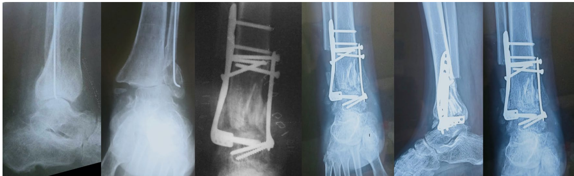
Fig. 2 Case example of an ankle fracture in a 68-year-old female managed initially by limited percutaneous fixation elsewhere but managed now with ankle arthrodesis and followed up till union of fusion site

ular approach (B) and was followed up till 6 months when the patient had complete fusion of the ankle joint and a relatively normal gait (C)