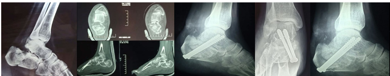
Fig. 4 Case example of displaced intra-articular Sanders IV calcaneus fracture managed with primary subtalar fusion along with bone grafting. After a follow-up of 3 months, the patient was able to weight bear with no ambulatory aid