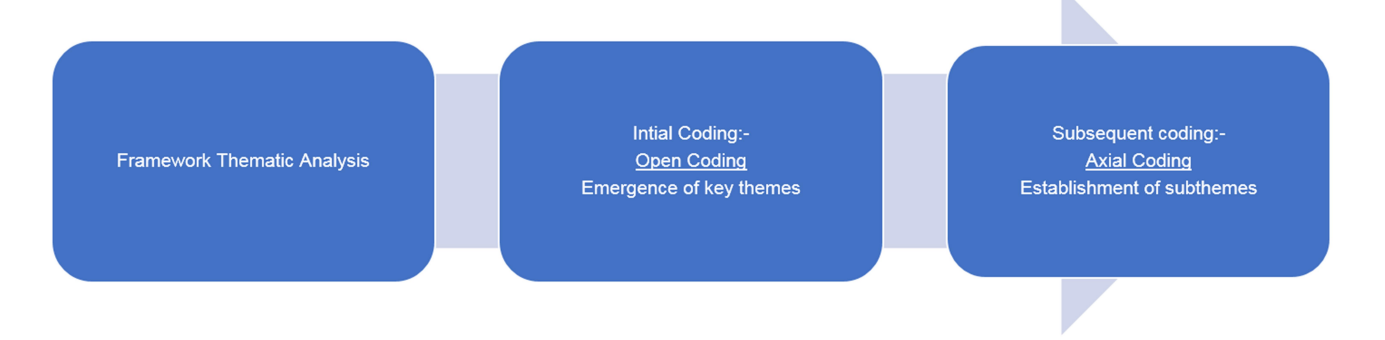
Figure 2 Stages of qualitative analysis process: an illustration.

Member checking also included sending the summary of coding and themes back to four participants who had indicated that they were willing to receive this summary via the CCWA and OCA support group coordinators.